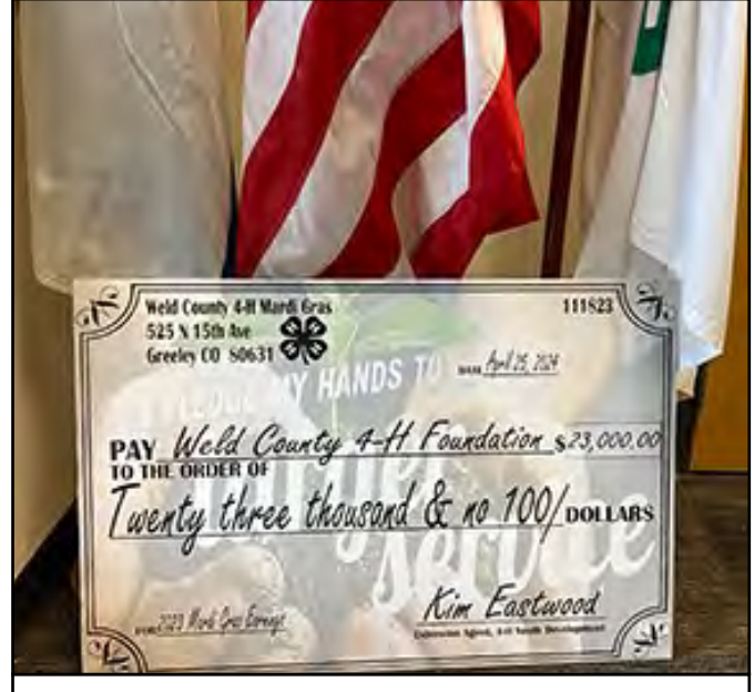
The Weld County 4-H Foundation was presented a check for $23,000.00.