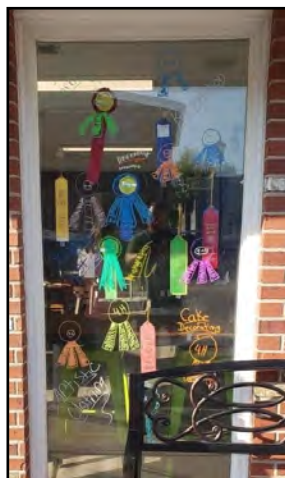
Taittwisters 4-H Club shows how to “Inspire Kids to Do” at the KM Cup in Fort Lupton.