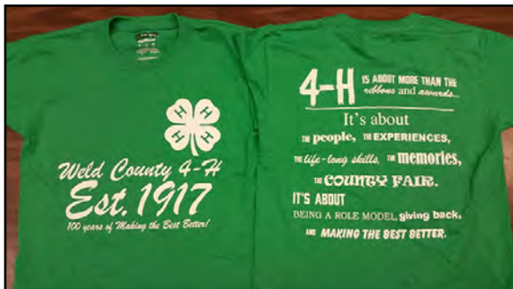
Weld County 4-H Est. 1917 t-shirt to the right is also available.