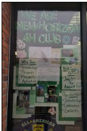
New Horizons 4-H Club shows how to “Inspire Kids to Do” at J & T Feeds in Greeley.