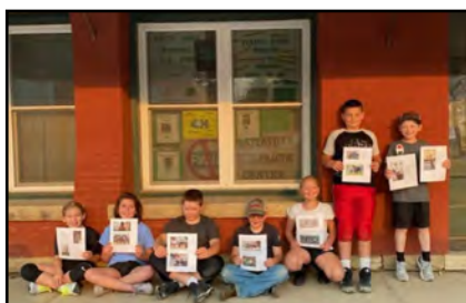
Platte River Pioneers 4-H Club express how to “Inspire Kids to Do” at Platteville Chiropractic in Platteville.