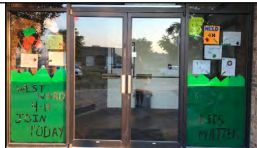
Westward 4-H Club promotes how to “Inspire Kids to Do” at Weld County Assessors Office in Greeley.