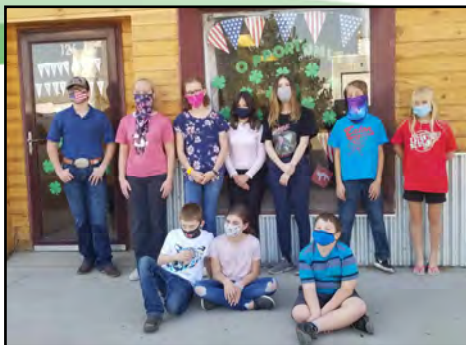
Small Town Critters 4-H Club express how to “Inspire Kids to Do” at Remax Alliance Team Goodvin in Eaton.

Congratulations to our clubs that participated in the 2020 4-H Window Display. Winners this year are 1 st place: Calico 'N Jeans earning $40 and Taittwisters in 2 nd place earning $20.00. Thanks to all our entries, we hope your club will consider doing a window display next year during National 4-H week! Thanks to the Youth Executive Council for sponsoring this award.