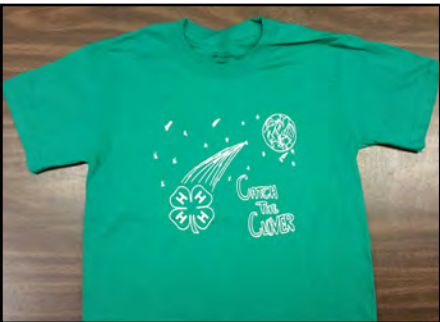
Catch the Clover T-Shirt to the left is the newest t-shirt we have.

Weld County Leaders Council has several t-shirts for sale. We have 2 styles of t-shirts, "Catch The Clover". This t-shirt was designed by Ryan Hamilton. These t-shirts cost $12.00 each for youth and adult sizes S-XL and $15.00 for adult sizes 2XL-4XL. We also have "Weld County 4-H Est. 1917" t-shirts for sale. These t-shirts cost $17.00 each for adults and $12.00 each for youth sizes. If you are interested in purchasing a t-shirt, please contact Michelle at 970-400-2076. Below are picture of each of the t-shirts.