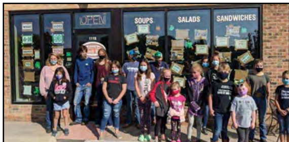
Calico 'N Jeans 4-H Club promotes how to “Inspire Kids to Do” at the Lunch Box in Johnstown.