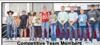
Competitive Team Members