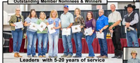
Leaders with 5-20 years of service