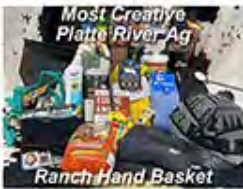
Most Creative Platte River Ag