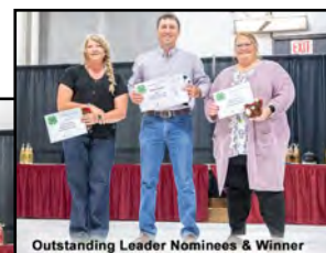
Outstanding Leader Nominees & Winner