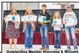
Outstanding Member Nominees & Winners