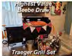
Highest Value Beebe Draw

Please deliver all baskets to the Extension Office by November 5th Include basket value & photo of all items in basket!