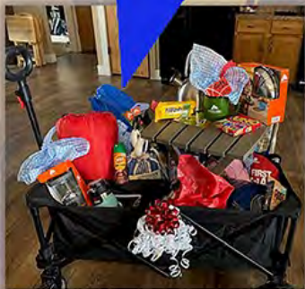
Galeton 4-H Camping Basket