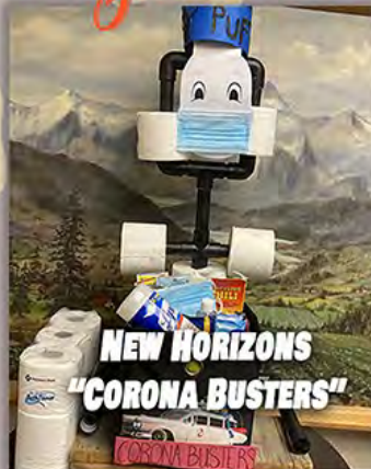
NEW HORIZONS "CORONA BUSTERS"