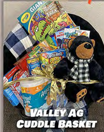
VALLEY AG CUDDLE BASKET