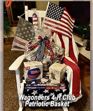
Wagoners 4-H Club Patriotic Basket

PLEASE BE SURE TO DELIVER YOUR CLUB'S BASKET & OTHER SILENT AUCTION ITEMS TO THE EXTENSION OFFICE NO LATER THAN NOVEMBER 5.