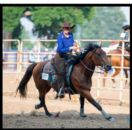
Western Adv 14-18 Res. Champion