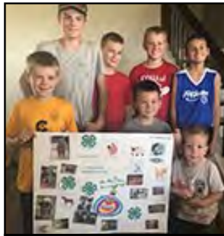
Platte River Pioneers 4-H Club promotes "I ♥ 4-H" at Nantes