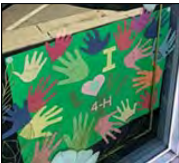
Keene 4-H Boosters Club shows "I ♥ 4-H" at Bombshell Bling Salon, in Keenesburg.