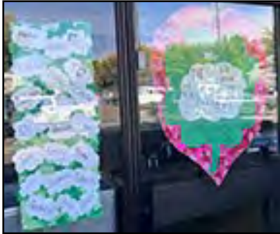
Blazing Clovers 4-H Club express "I ♥ 4-H" at Tractor Supply in Greeley.