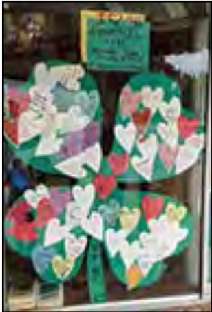
Galeton 4-H Club promotes "I ♥ 4-H" at Rea's Diner at Dillards in Galeton.

Congratulations to our clubs that participated in the 2023 4-H Window Display. Winners this year are 1st place: Galeton earning $60.00 and Blazing Clovers in 2nd place earning $40.00. Thanks to all our entries, we hope your club will consider doing a window display next year during National 4-H week! Thanks to the Youth Executive Council for sponsoring this award.