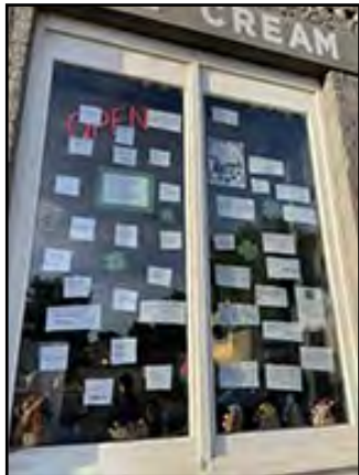
Calico 'N Jeans 4-H Club express "I ♥ 4-H" at Goober's Ice Cream in Milliken.