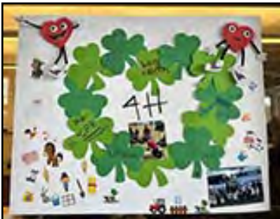
Centennial Clovers 4-H Club shows "I ♥ 4-H" at Platte Valley Fire Department in Kersey.